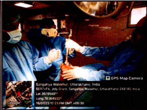
Delegates being trained by experts during Workshop on Hands on Experience in Knee Arthroplasty