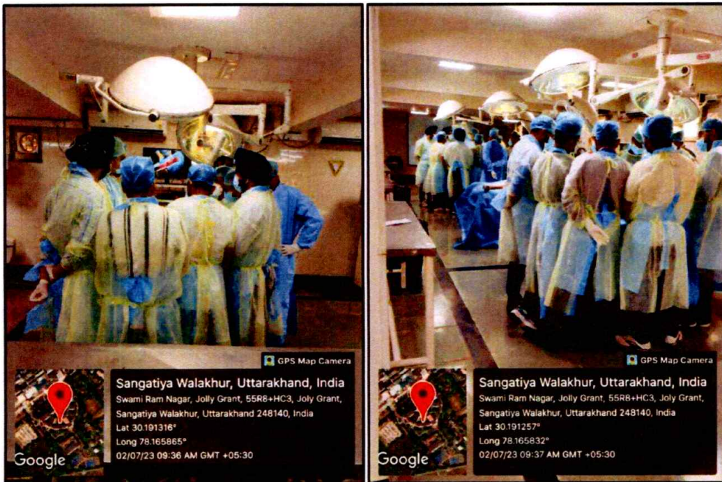
Delegates actively participating in the Workshop on Hands-on-experience in Orthopaedic oncology procedures