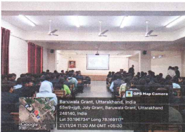
Glimpse of the session at HSST Auditorium