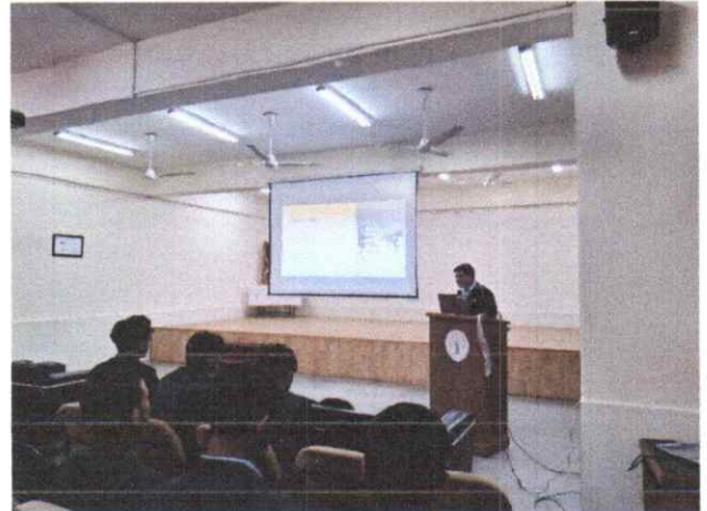
Session conduction in HSST Auditorium