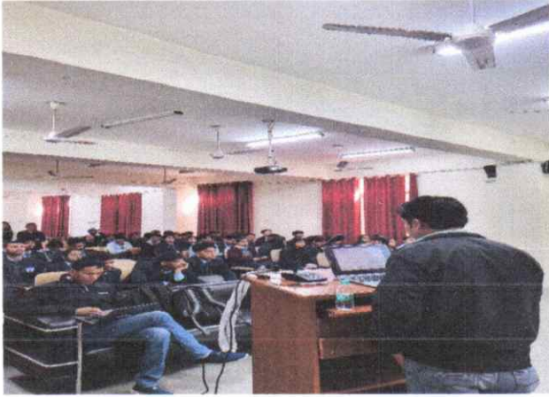
Lecture on Prompt Engineering for developers

Himalayan School of Science and Technology A Constituent Academic Unit of Swami Rama Himalayan University