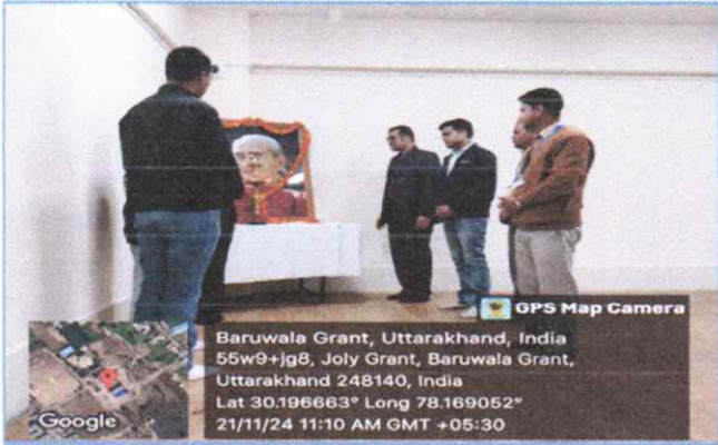
Lamp Lightening Ceremony by the Speakers (Rubico IT Ltd) Haridwar and SRHU Faculty members