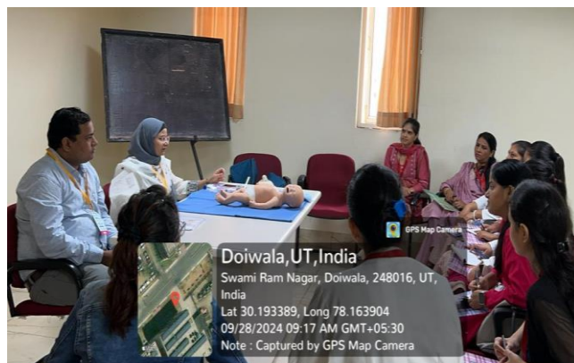
Pic 3: Sessions on KMC & Breast feeding