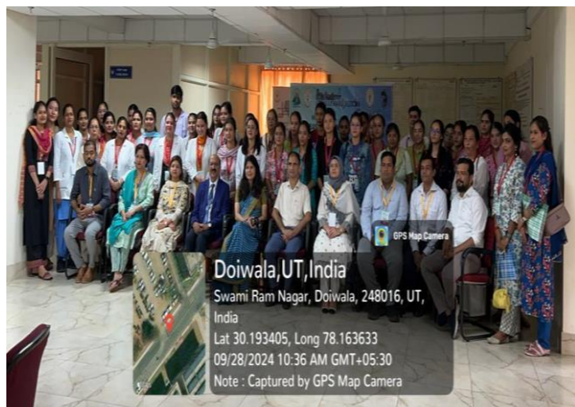
Pic 1: Participants and organizers