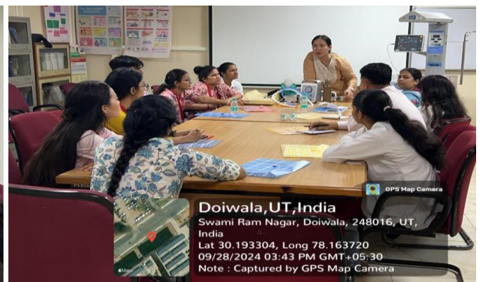
Pic 4: Sessions on Resuscitation & NICU Equipment