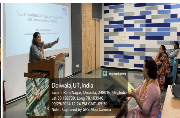
Pic 7: CNE Sessions in progress