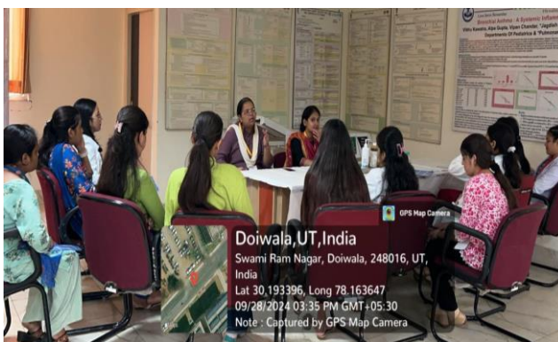
Pic 6: Sessions on Biomedical Waste Management