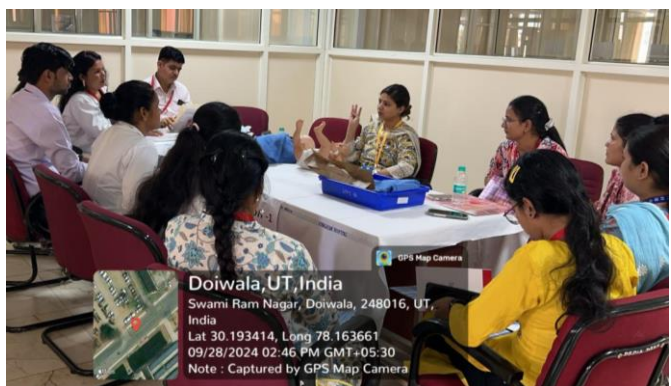
Pic 5: Sessions on care of a crashing newborn & thermal protection