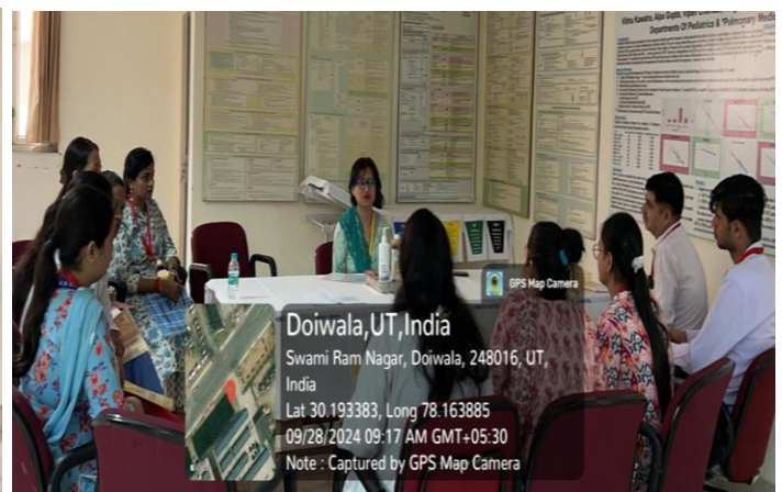
Pic 2: Session on Hand Hygiene & Infection Control