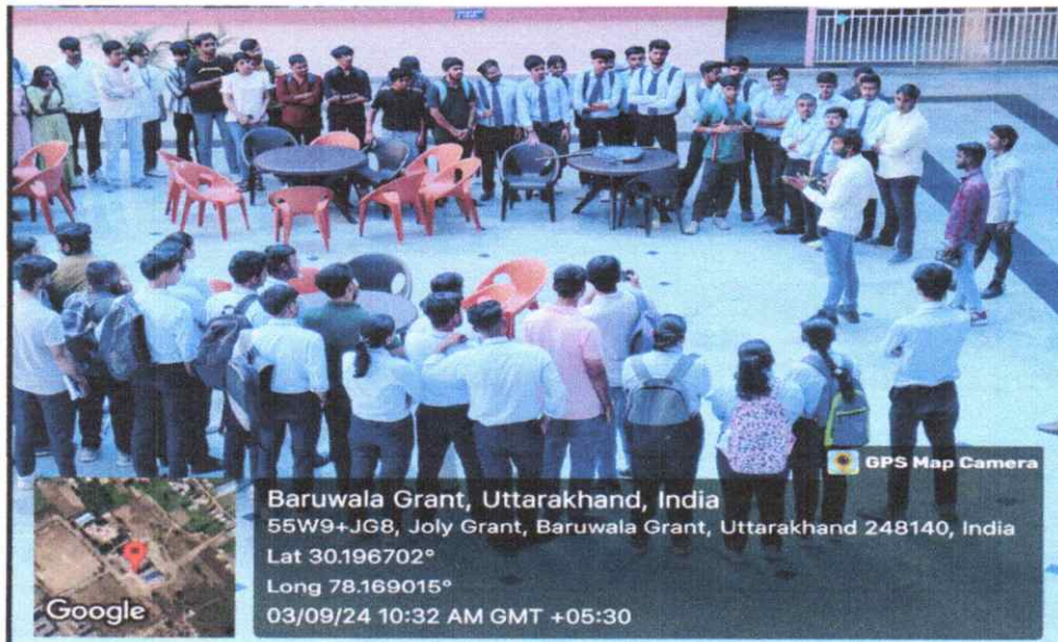
“Trainer showing the Drone functionalities to students”