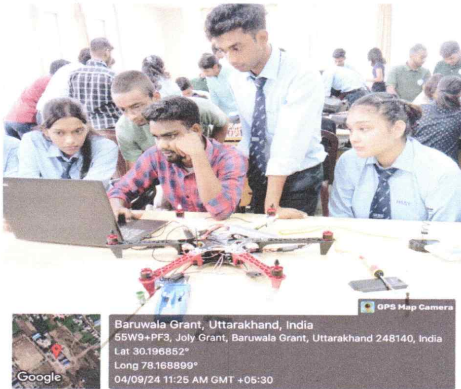
“Students testing drones after during assembly “