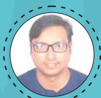
Dr. Harish Singh Koshiyari Trade & Exhibition