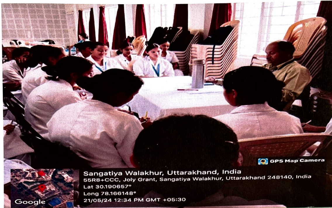
Picture 5: Facilitator and beneficiaries on Workstation 5: Care of Baby under Phototherapy