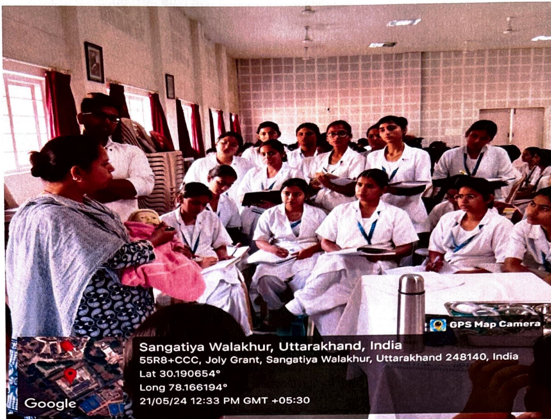
Picture 3: Facilitator and beneficiaries on Workstation 3: Feeding Methods