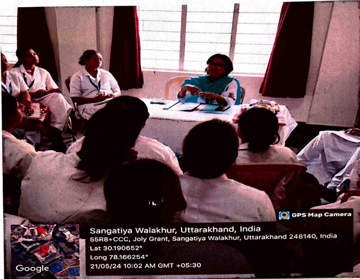
Picture 1: Facilitator and beneficiaries on Workstation 1: Thermoregulation