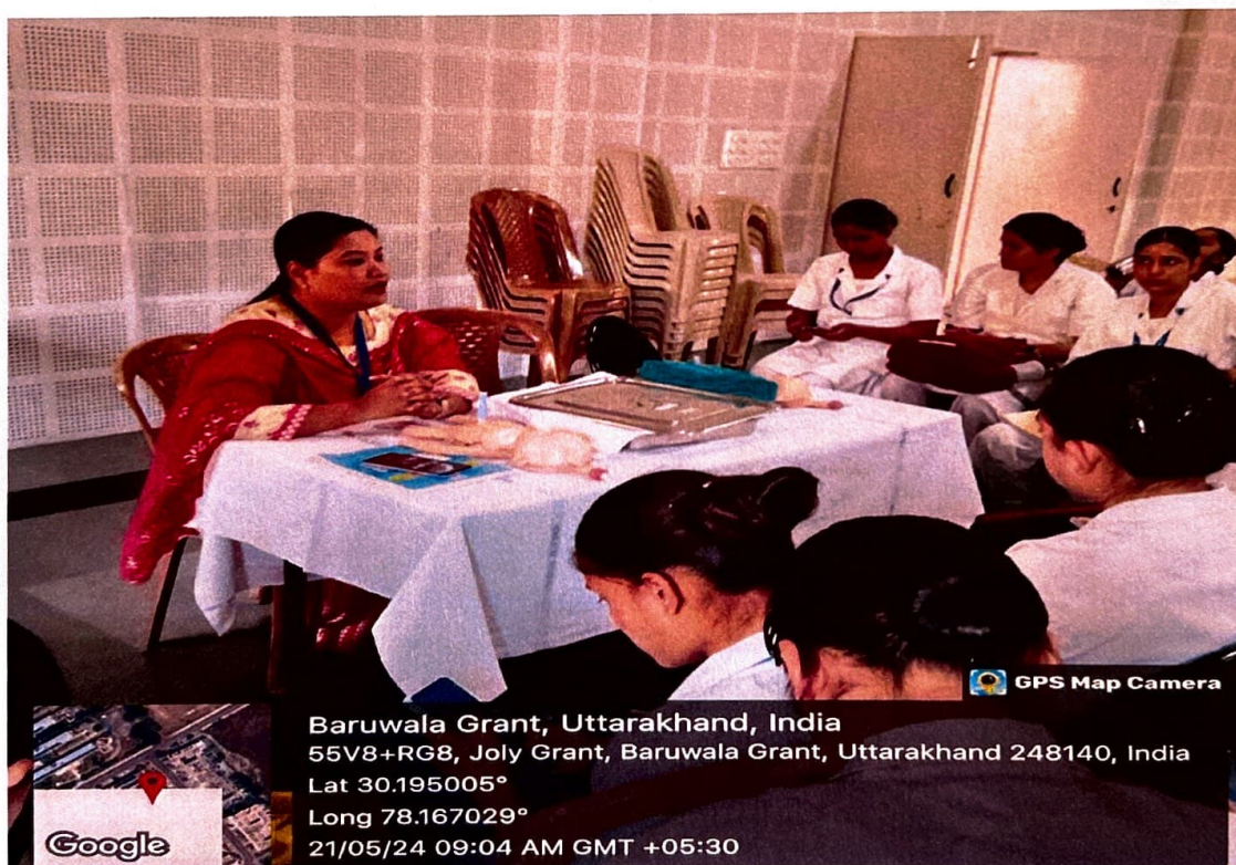
Picture 4: Facilitator and beneficiaries on Workstation 4: Neonatal Resuscitation