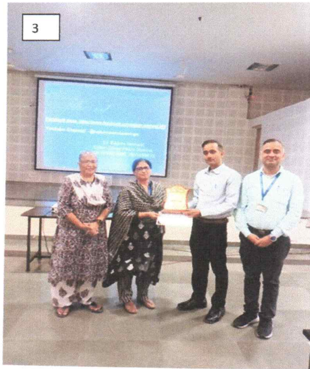
Picture -3 Guest Speaker being felicitated with a memento by the Principal, Himalayan College of Nursing following the Session