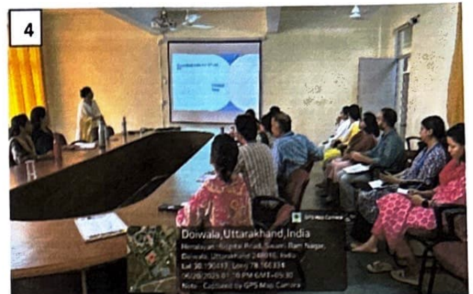
Figure No. 3 and 4: Speaker concluding the session