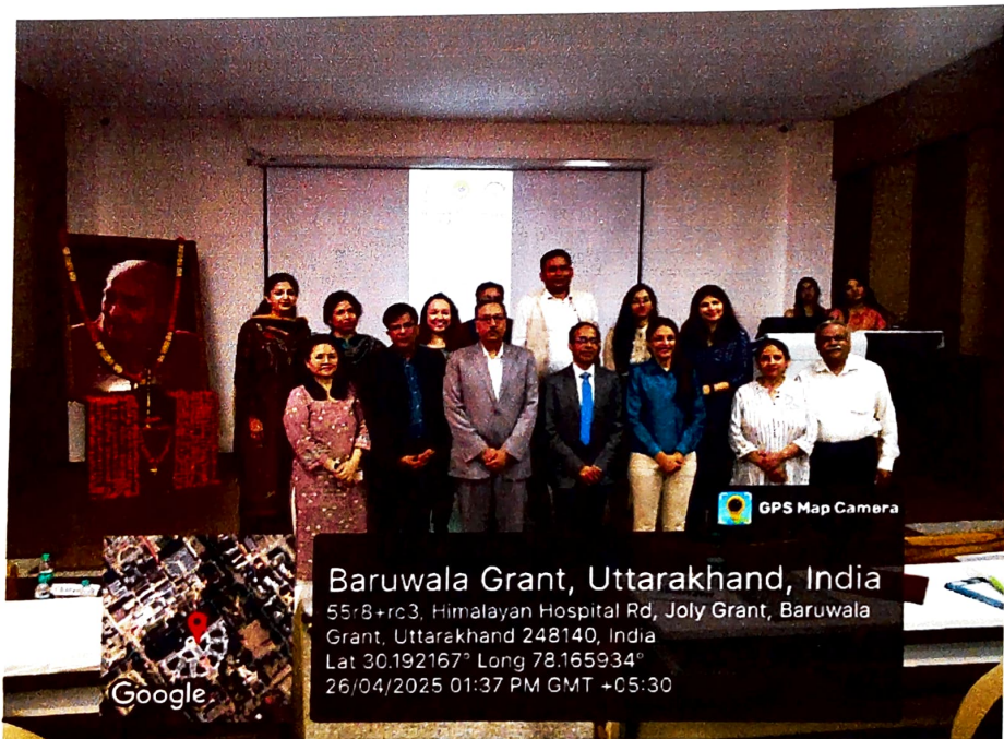
Speakers of CME