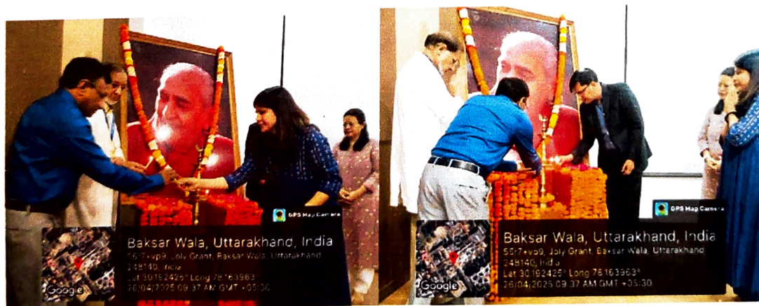
Faculty lit lamp before "Swami Rama"