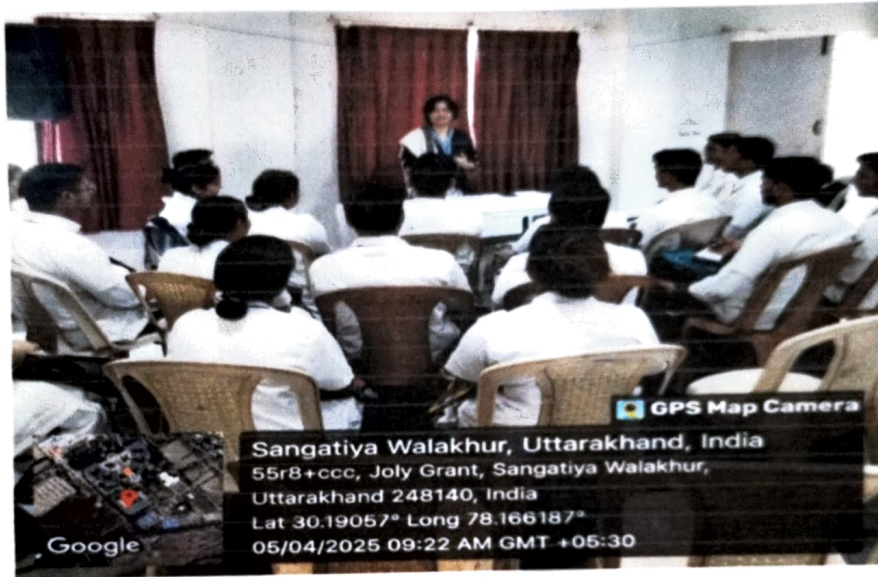
Picture 2: Workstation on Identification and Management of Malaria (Infant & Young Children)

After completing all workstations, participants engaged in scenario-based skill assessments, where they performed IMNCI tasks in simulated scenarios. Additionally, students showcased role plays on diagnosis and management of malaria, malnutrition, and anemia, demonstrating great enthusiasm and precision.