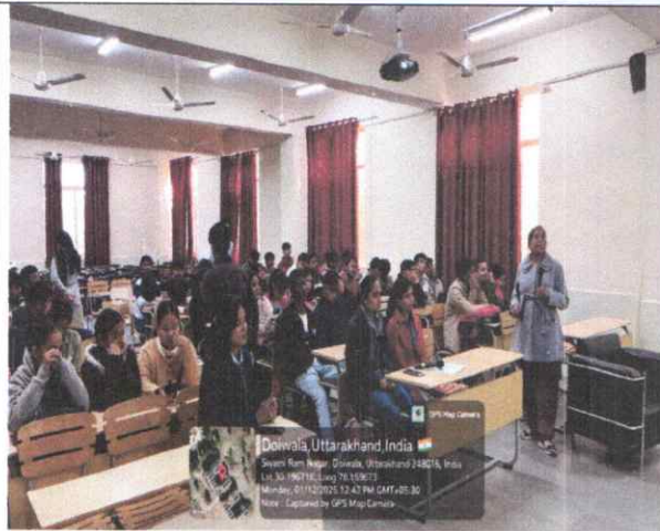
Active Student Participation