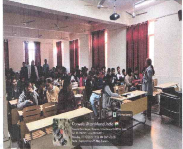
Guest Lecture on HIV Prevention