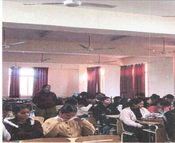
Students at Awareness Session