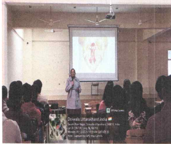
World AIDS Day Awareness Session