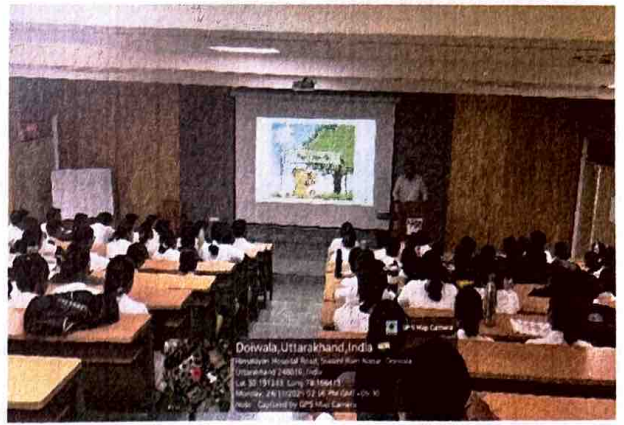
Figure 1 and 2: Alumni interacting with students