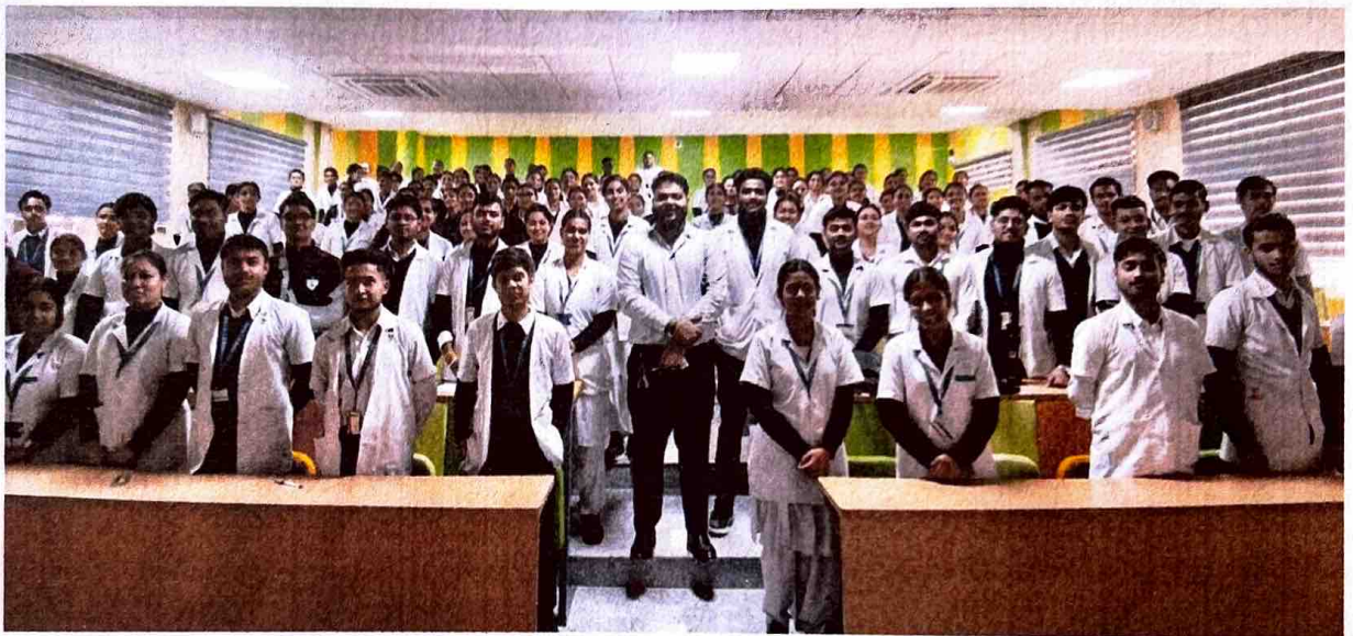
Figure 3: Group Photograph of Alumni with students