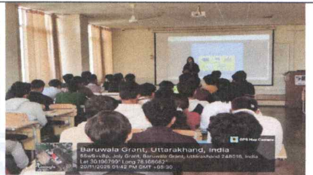
Figure 2: Session on Cyber Hygiene