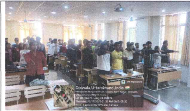
Figure 1: Taking Oath by the students