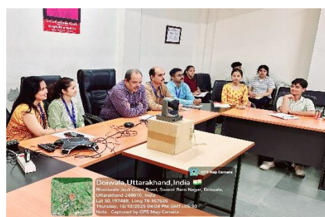
A Symposium on World Food Day