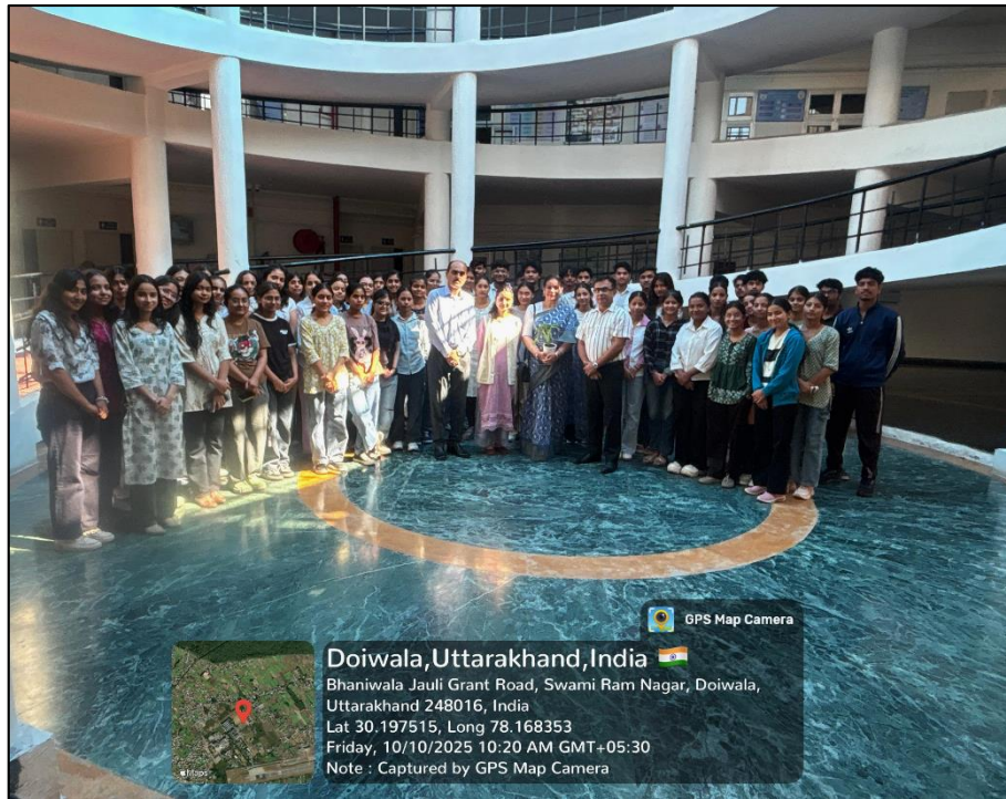
Group photograph of faculty members, students, and the distinguished speaker, marking the successful conclusion of the Guest Lecture on Mental Health Awareness