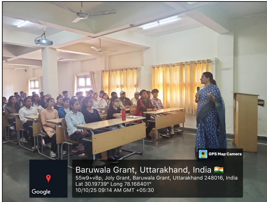
Participants attentively engaging in the guest lecture on Mental Health highlighting the importance of psychological preparedness and coping strategies