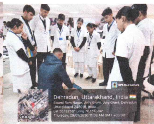
Instructors showing demonstrations to the students