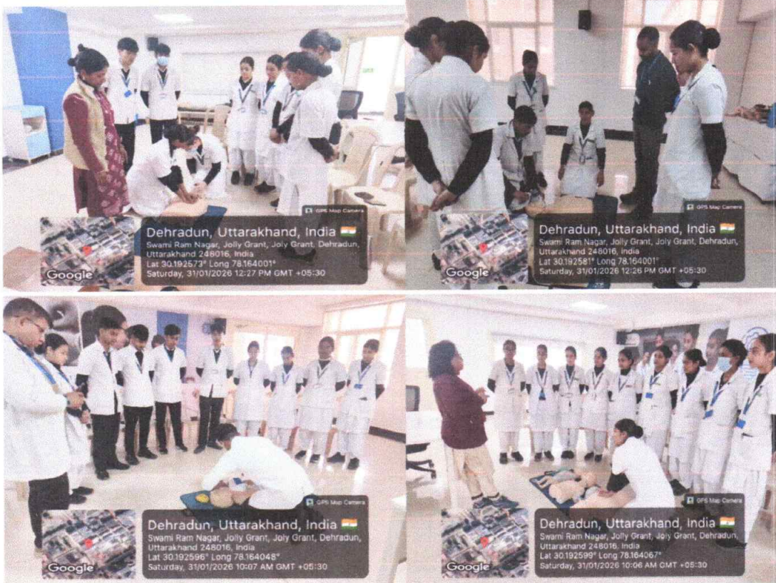
Students practicing cardiopulmonary resuscitation