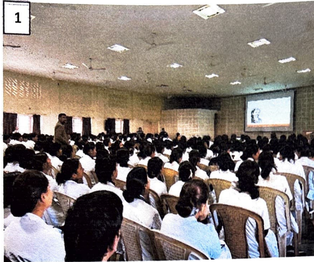
Figure No. 1: Speaker introducing the topic to faculty members