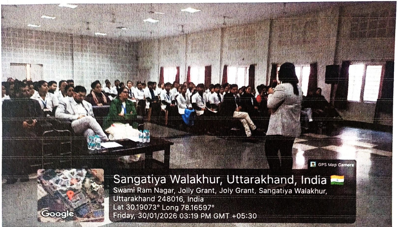
Pic.3. Resource person from the team of Learnnet skills delivering a lecture

The session further covered German language requirements, along with the training pathway, hospital placement, licensing procedures, and visa support available for aspiring candidates. Success stories of Indian nurses working in Germany were shared, offering practical insights into migration and professional adaptation.