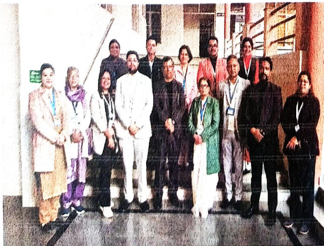
Pic.1 Group Photographs with the team of Learnet Skills