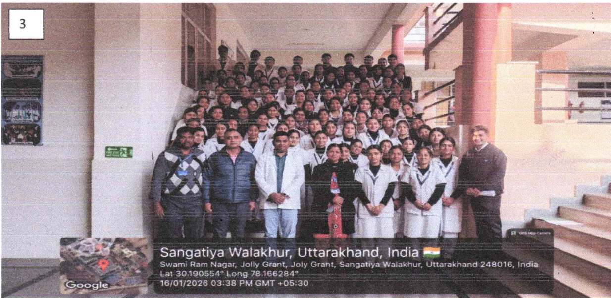
Picture 3 Group Photo with Guest Speaker