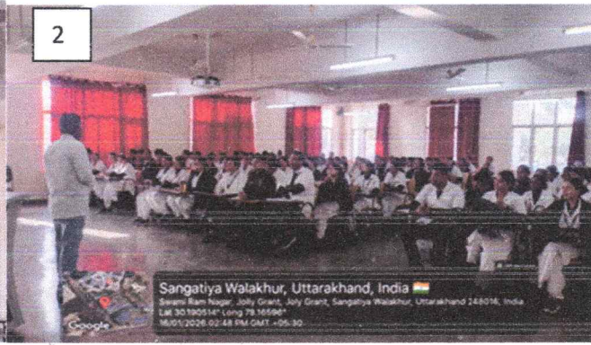
Picture 1 & 2 Session was taken by Guest Speaker