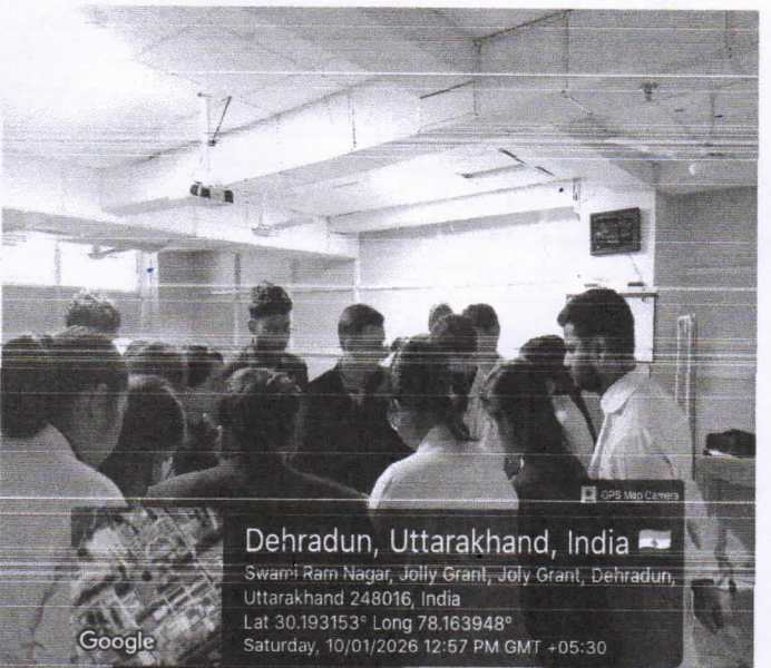
Dehradun, Uttarakhand, India Swami Ram Nagar, Jolly Grant, Joly Grant, Dehradun, Uttarakhand 248016, India Lat 30.193153° Long 78.163948° Saturday, 10/01/2026 12:57 PM GMT +05:30