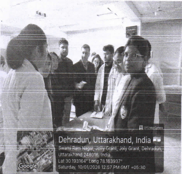
Dehradun, Uttarakhand, India Swami Ram Nagar, Jolly Grant, Joly Grant, Dehradun, Uttarakhand 248016, India Lat 30.193164° Long 78.163937° Saturday, 10/01/2026 12:57 PM GMT +05:30