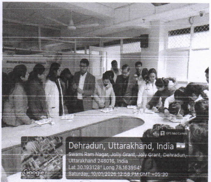
Dehradun, Uttarakhand, India Swami Ram Nagar, Jolly Grant, Joly Grant, Dehradun, Uttarakhand 248016, India Lat 30.193128° Long 78.163954° Saturday, 10/01/2026 12:58 PM GMT +05:30