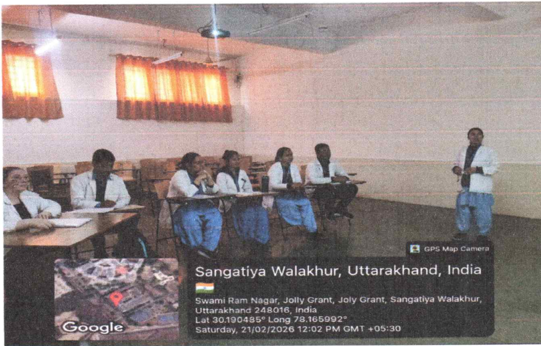
Pic.2 All beneficiaries are attending the seminar