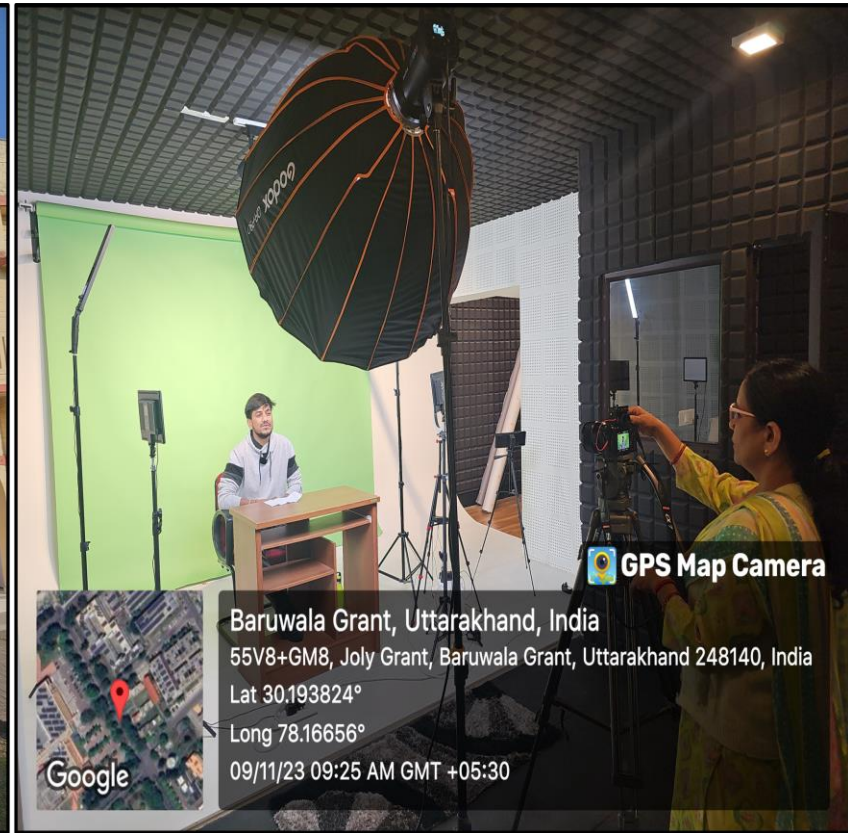
Video recording session of lecture at Studio, SRHU