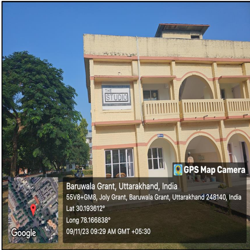
E-Content Development Facilities Studio Available at SRHU