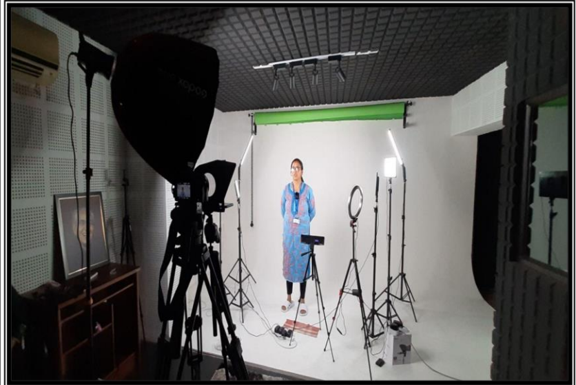
Video recording session of the lecture at Studio, SRHU