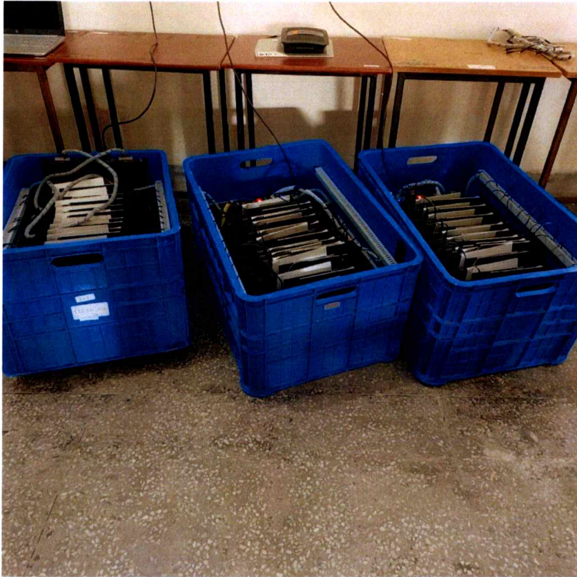
Figure 4- Paper less examination machines at the University