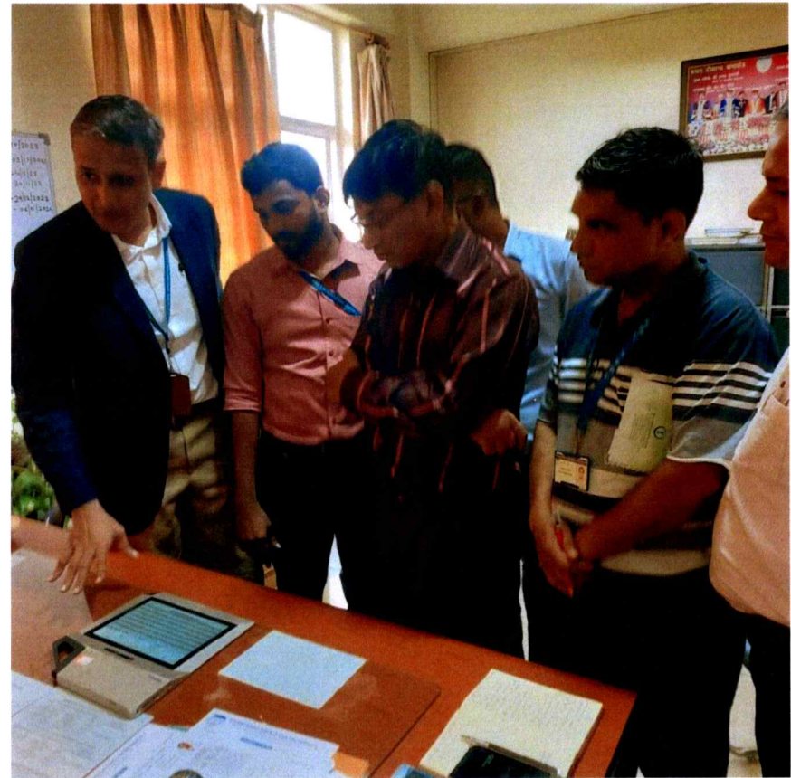
Figure 2- Orientation session on the use of Software to the COE staff