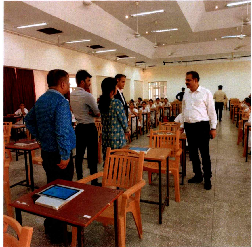
Figure 5- Vice chancellor interacting with the Faculty and Students post the conduction of examination