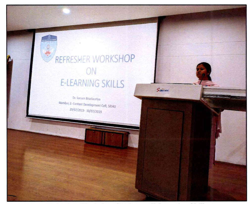
Refresher Workshop Session on E-Learning Skills