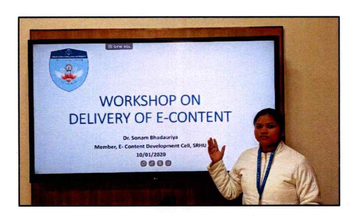
Session on Delivery of E-Content