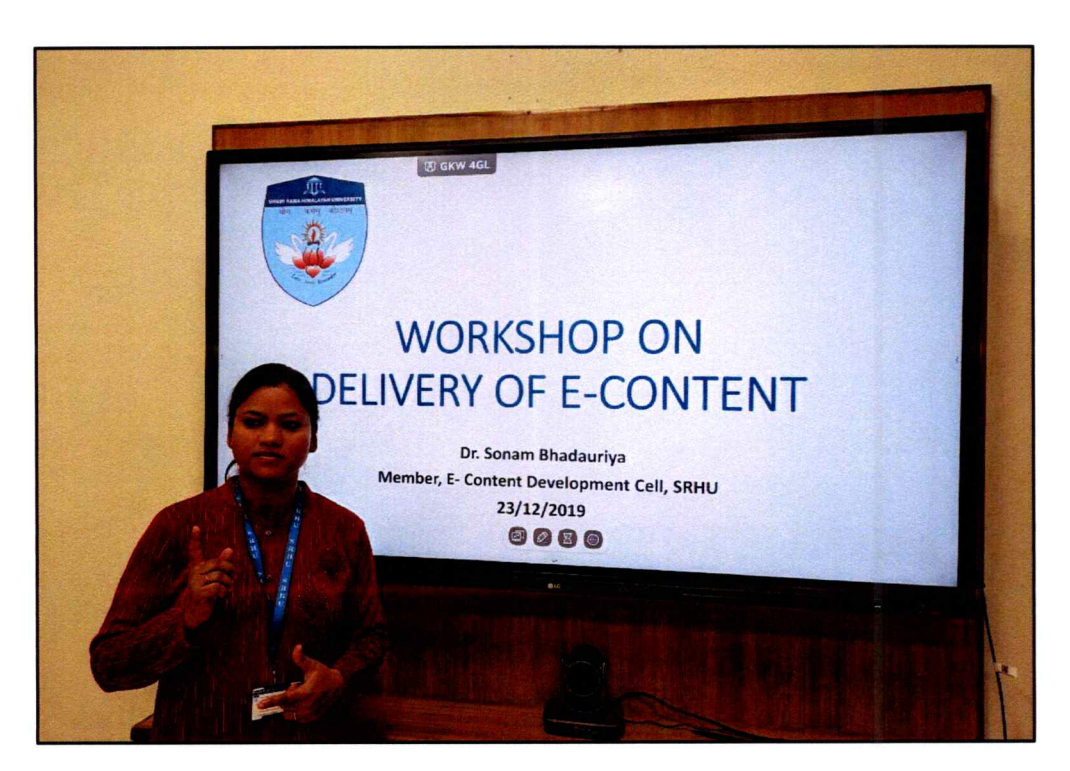
Session on Delivery of E-Content