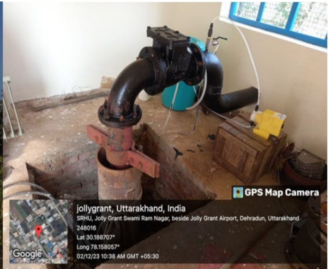
Tube well -3