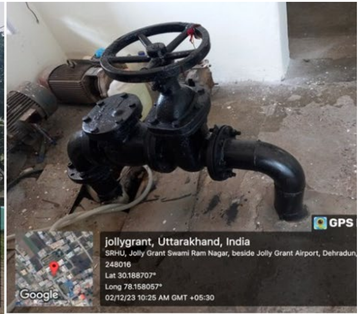
Tube well -1