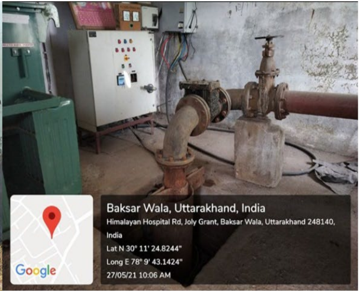
Tube well -2