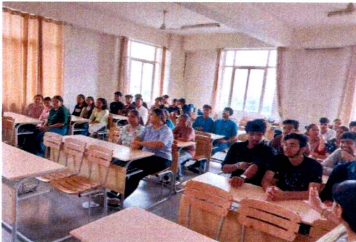
Bridging the gap between education Employability

A total of 47 students participated in the workshop, making it a highly engaging and impactful learning experience.