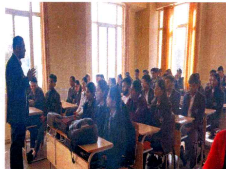
Empowering students with essential and Professional skills