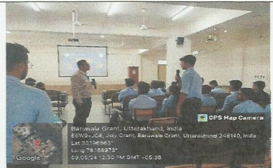
"Student Asked doubts in Session"