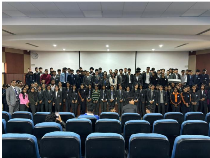
Lecture on Goal Setting and Motivation

The session concluded on an inspiring note, leaving the students with a renewed sense of purpose, determination, and confidence to face the challenges of their academic and professional journey. A total of 75 students participated in the workshop, making it a memorable and impactful learning experience.