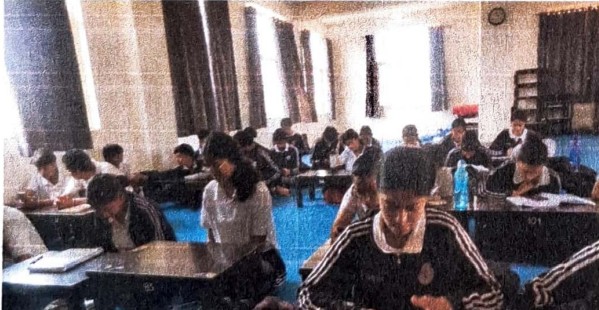
Interactive quiz participation