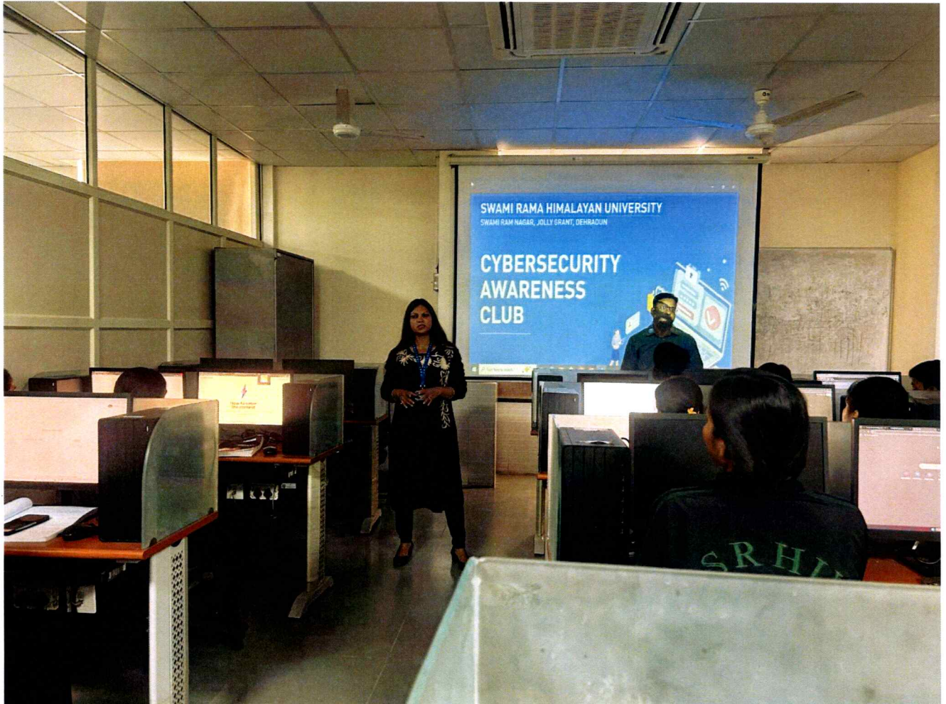
Welcome Address by the chairperson on One day Seminar