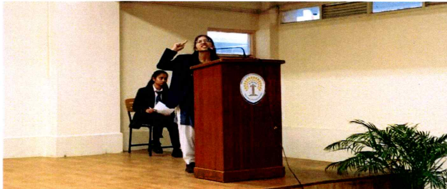
Student delivering her opinion on the topic during Debate Competition