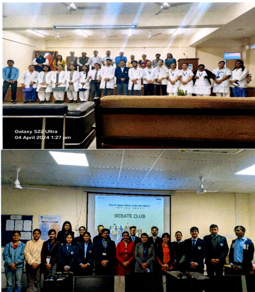
Group Photographs of the participant with the Chief Guest and judges panel