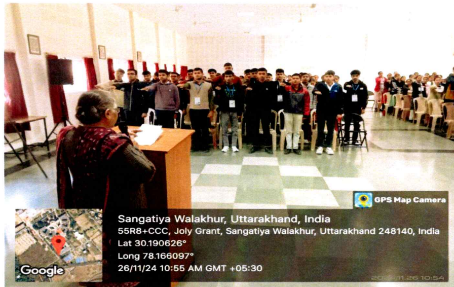
Students taking the pledge to uphold the values of the Indian Constitution