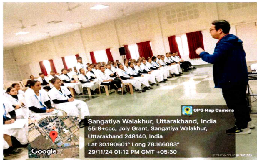
Educational talk on the Constitution and the POCSO Act with legal and ethical insights