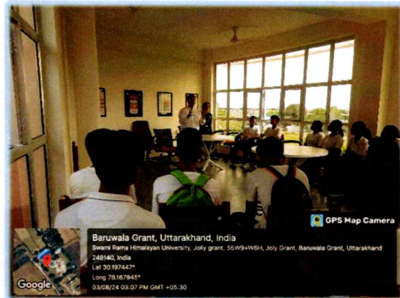
Brain storming Session of Students on an Idea to Startup