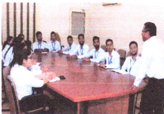
Speaker giving information on media communication