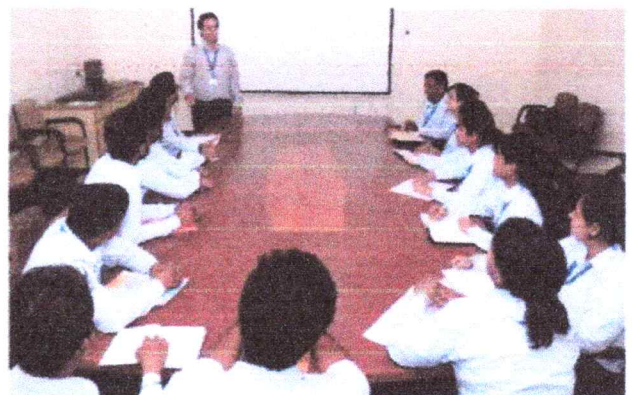
Students attending Q&S Session