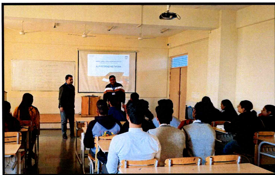
AspireGrad delivering its lecture