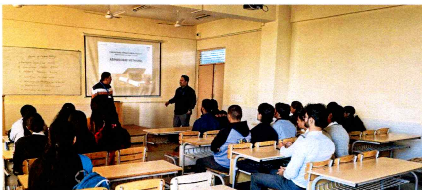
AspireGrad Club Members Interacting with students