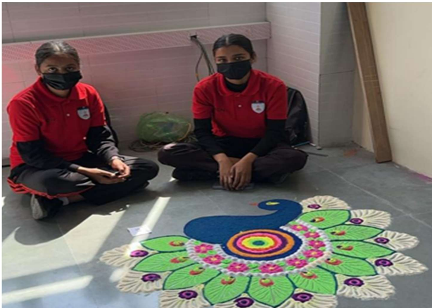
Pic 1 Rangoli Competition by Literary and Fine Arts Club, SRHU

This artistic celebration provided a meaningful platform for students to display their talent, fostering an appreciation for fine arts within the SRHU community.