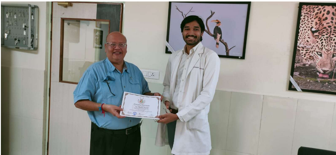
Pic 4: Student receiving certificate from the Chairperson during the Poster Making Competition