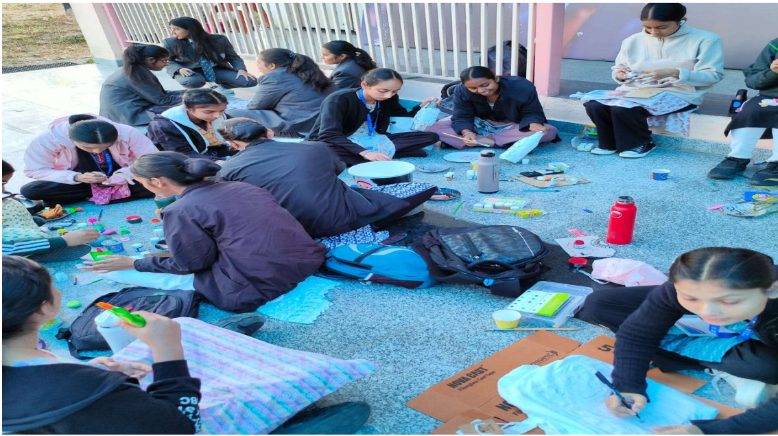
Pic 3: Bottle and pebble painting Competition by Literary and Fine Arts Club