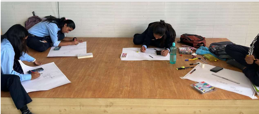
Pic 2: poster making Competition by Literary and Fine Arts Club