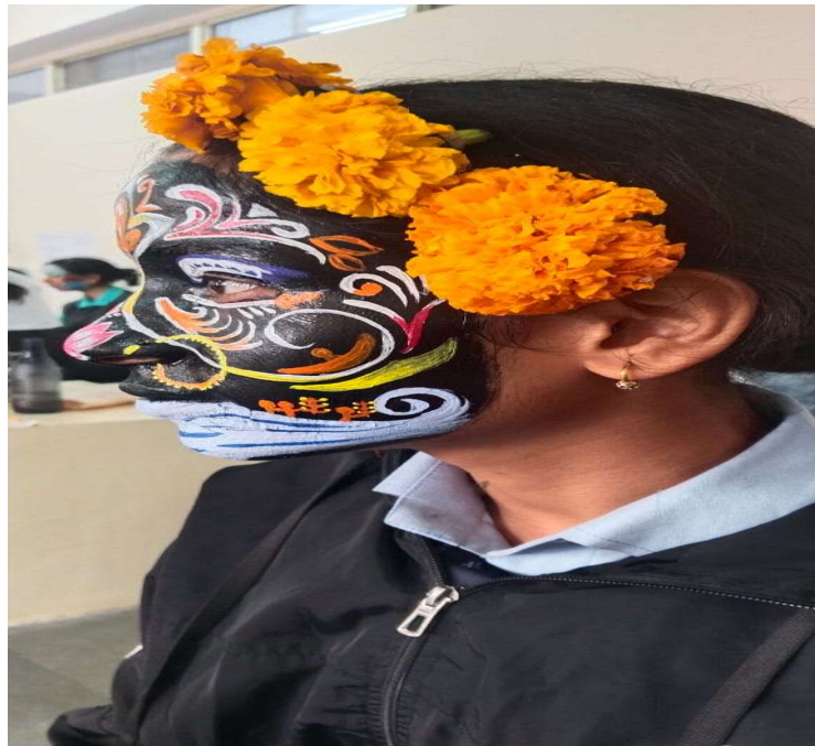
Pic 2: Face Painting that Speaks Creativity