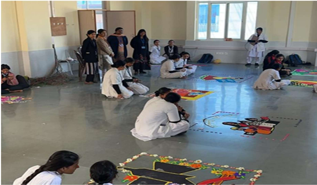
Pic 1 Rangoli Competition by Literary and Fine Arts Club, SRHU

This artistic celebration provided a meaningful platform for students to display their talent, fostering an appreciation for fine arts within the SRHU community.