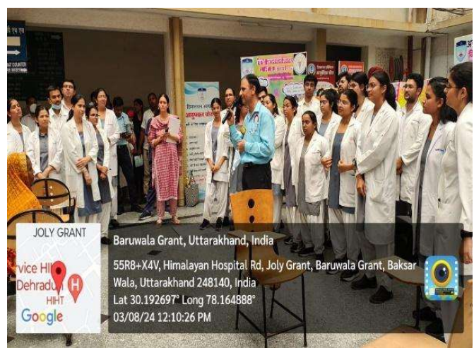
Students and faculty members from the pediatric ward, HIMs SRHU, counselling sensitizing new mothers on the importance of breastfeeding