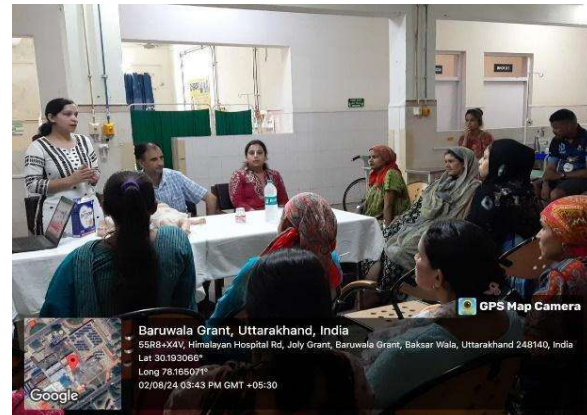
Students and faculty members from the pediatric ward, HIMs SRHU, counselling sensitising new mothers on the importance of breastfeeding