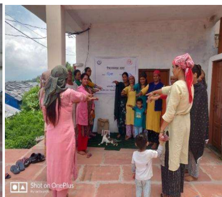
Participants from Nagthat Kalsi attending the oath and awareness session of the importance of breastfeeding for mothers and newborns