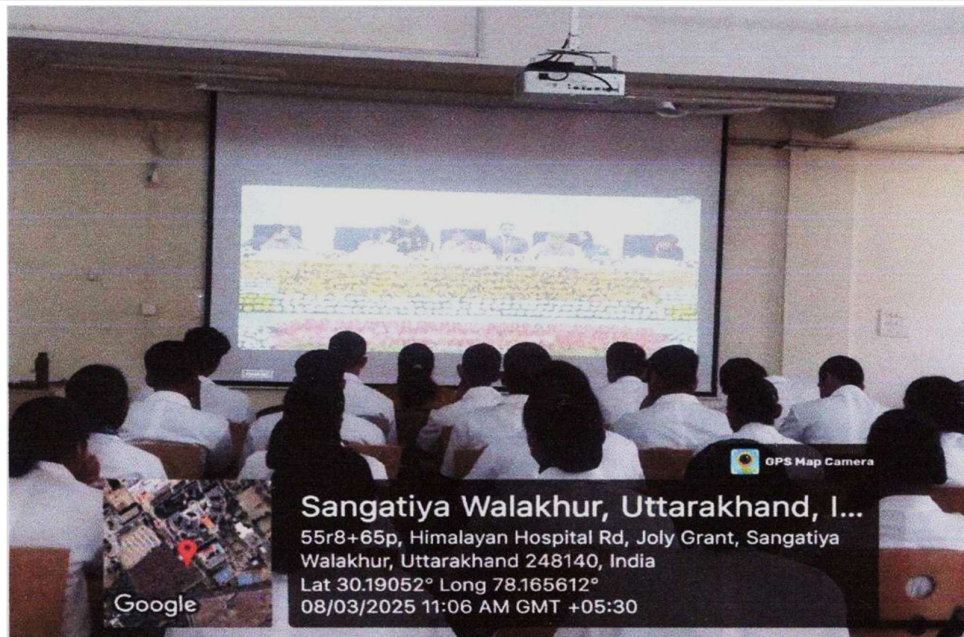
Telecast of National conference on the occasion of International Women's Day attended by 87 participants