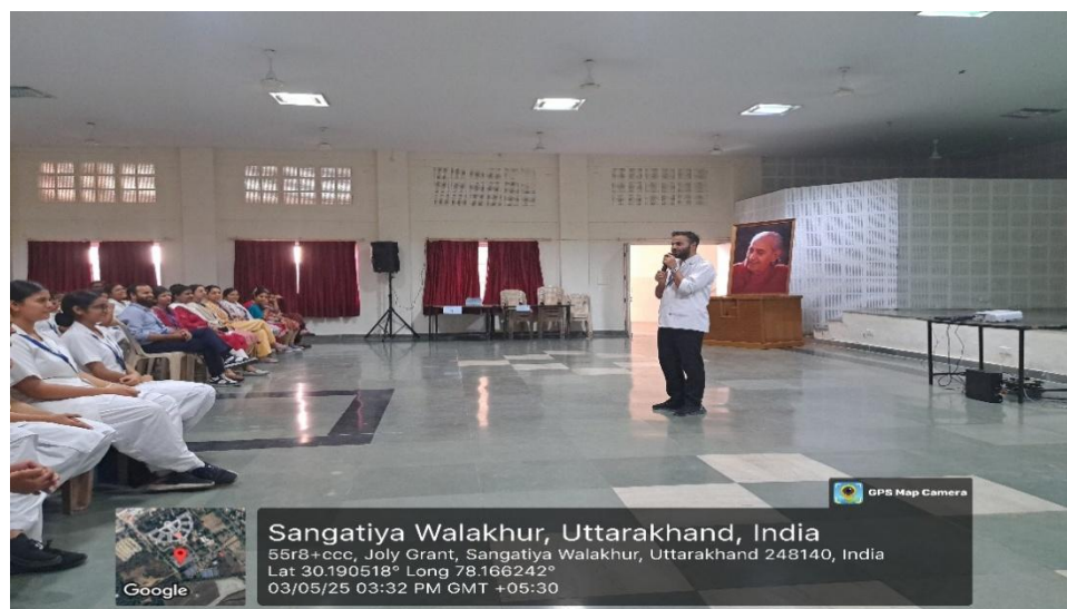
Pic 2. Laughter Exercise