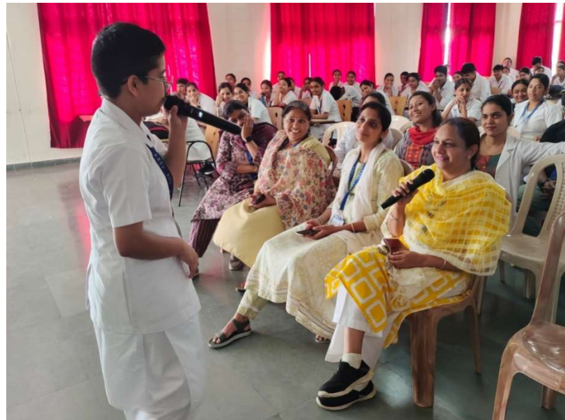
Pic-2 Student and Teacher Interaction in a Game