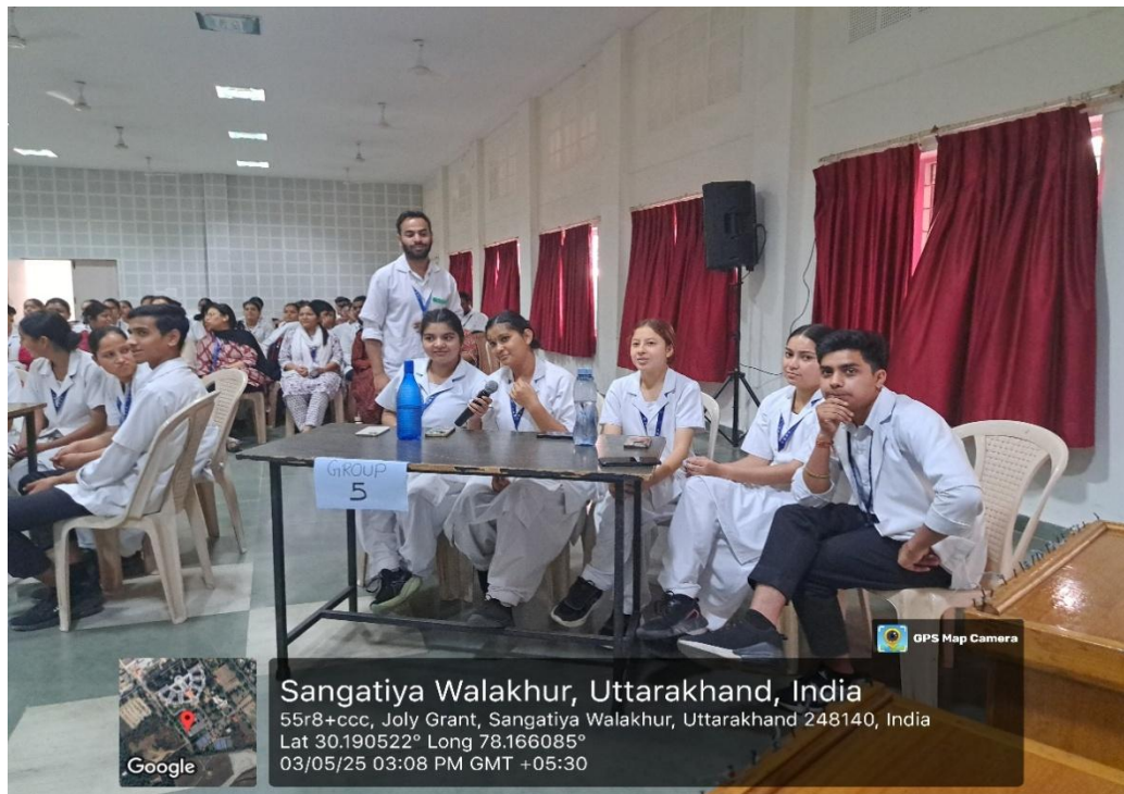
Picture 1 Quiz Competition