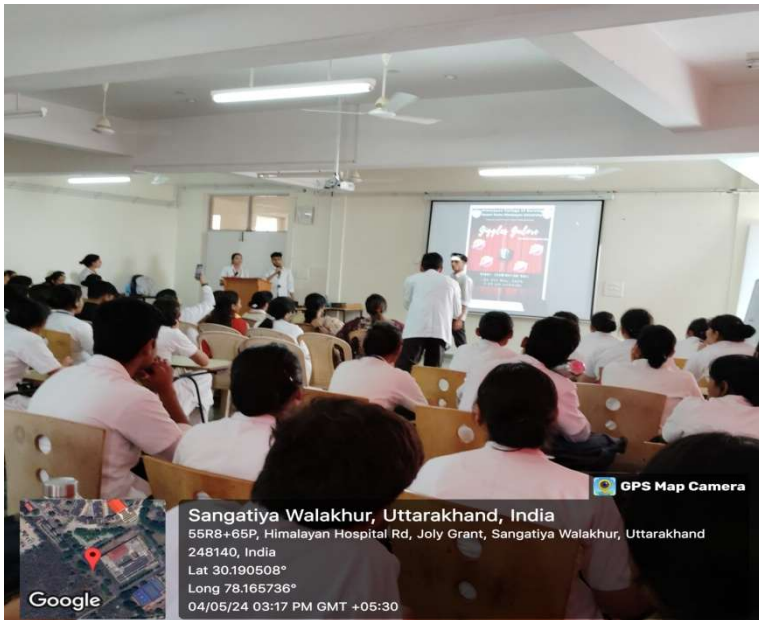
Pic 1- Student performing in the Event