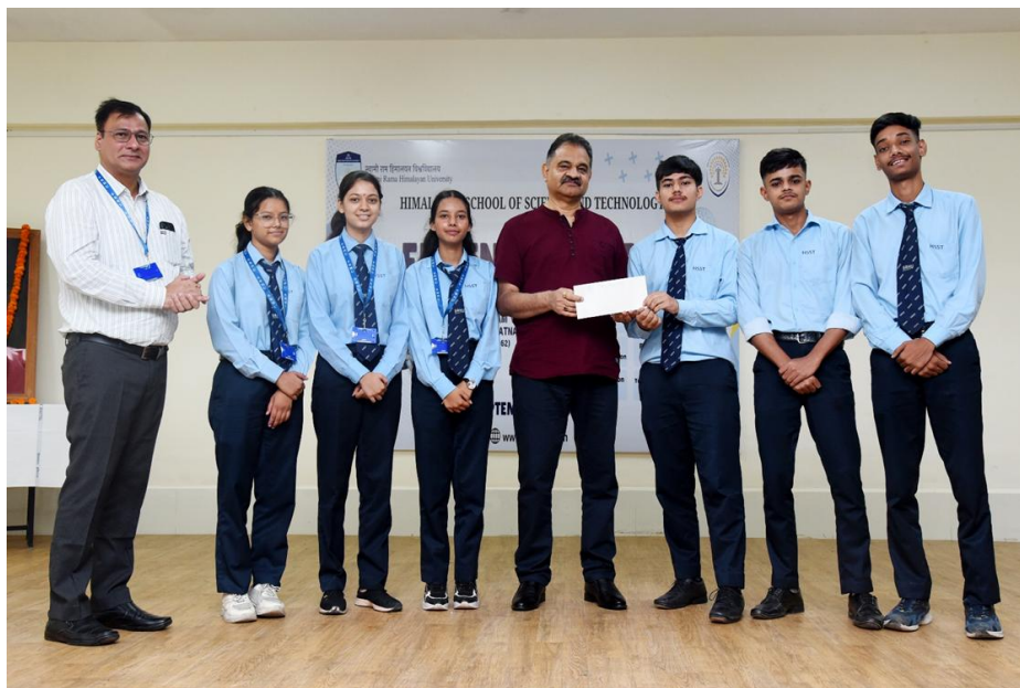
Winners of Tech Forge 2024 being felicitated for their outstanding innovation and teamwork