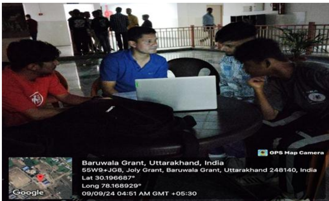
Students brainstorming and exchanging ideas at Tech Forge 2024