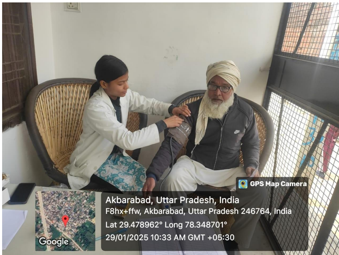
Our Students checking vitals at Akbarabad, Bijnor