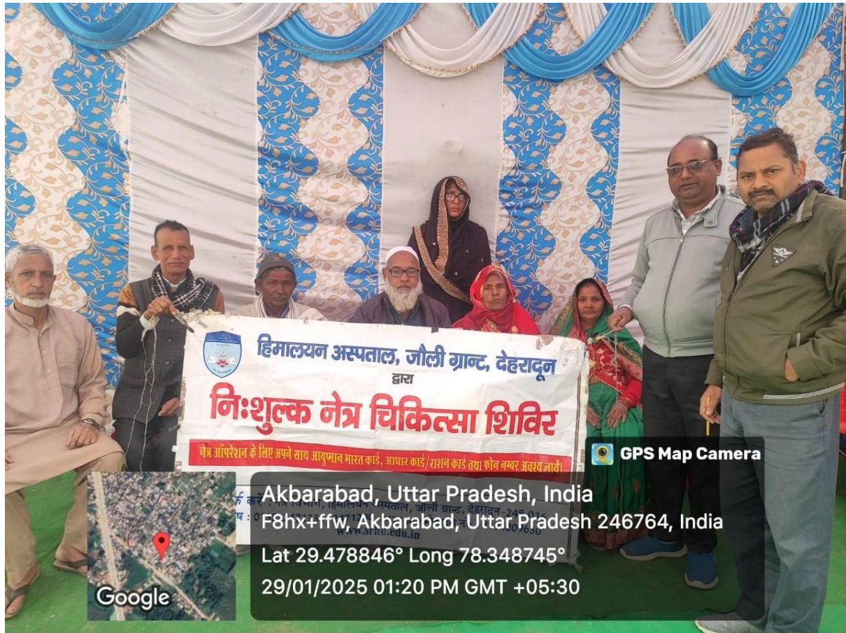
Participants taking benefits of Camp