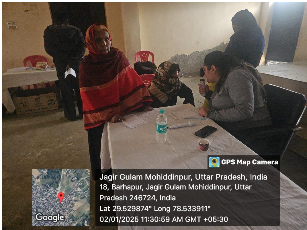
“Hands-on learning in action — students checking vitals at Jagir Gulam”