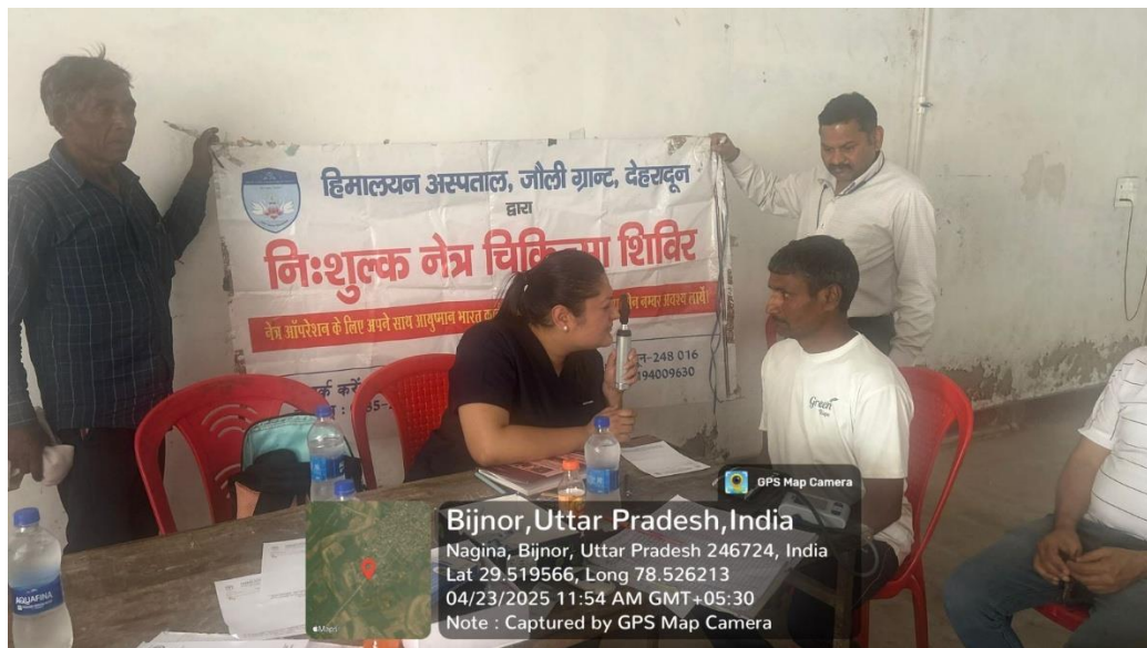
"Health, service, and learning at Bijnor Uttar Pradesh