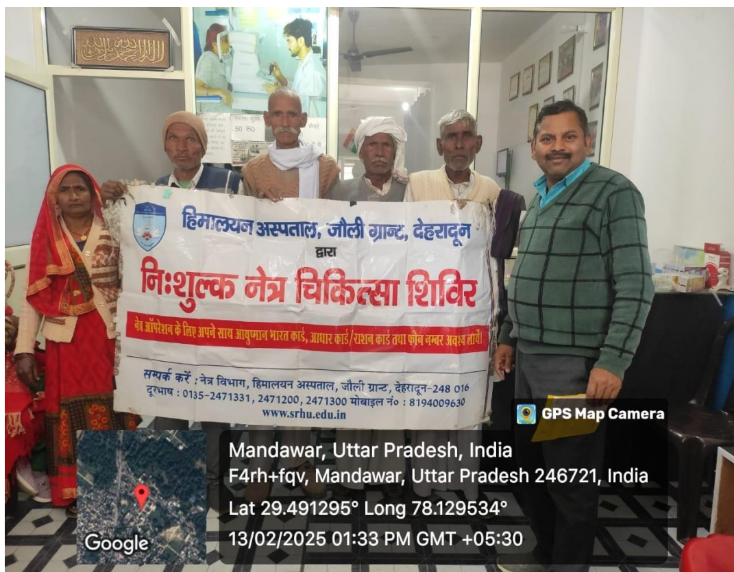
Participants taking benefits of Camp