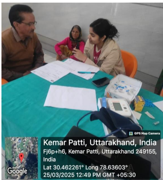
Counselling of patients for eye care