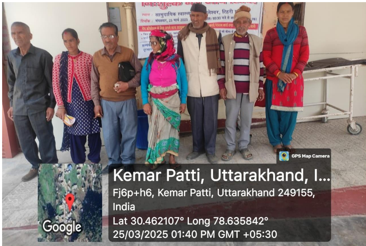
Beneficiaries of the camp