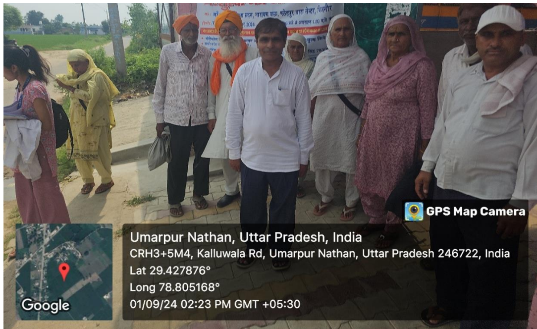
Beneficiaries of the camp