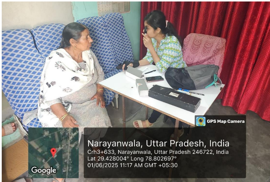
Screening of vision