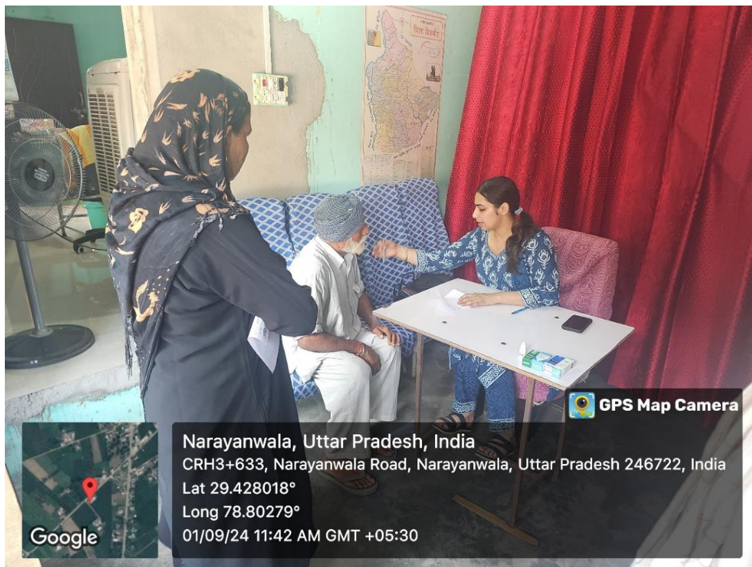
Counselling of patients for eye care