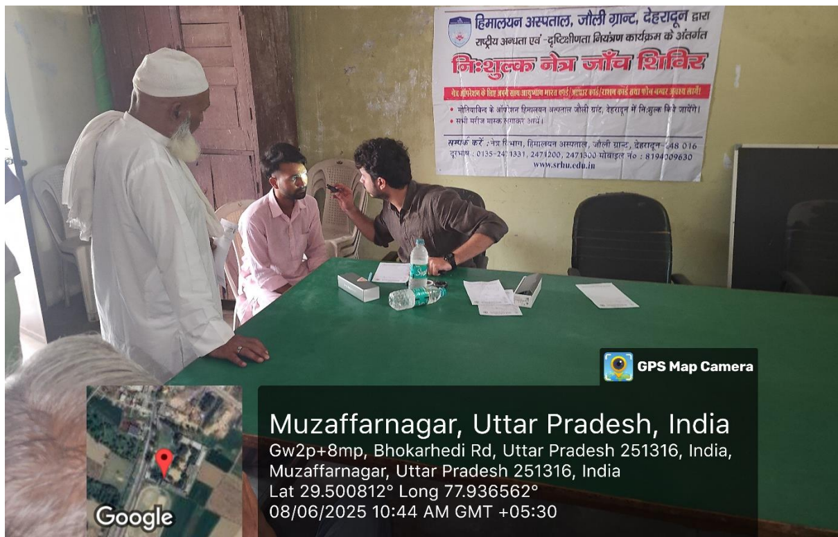
Students checking the eyes of a patient during the screening camp.