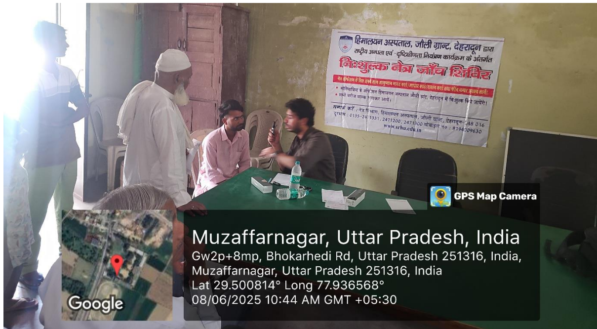
Hands-on learning: Students assessing a patient's vision.