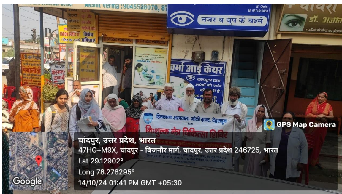
People actively participating in the community eye-care camp