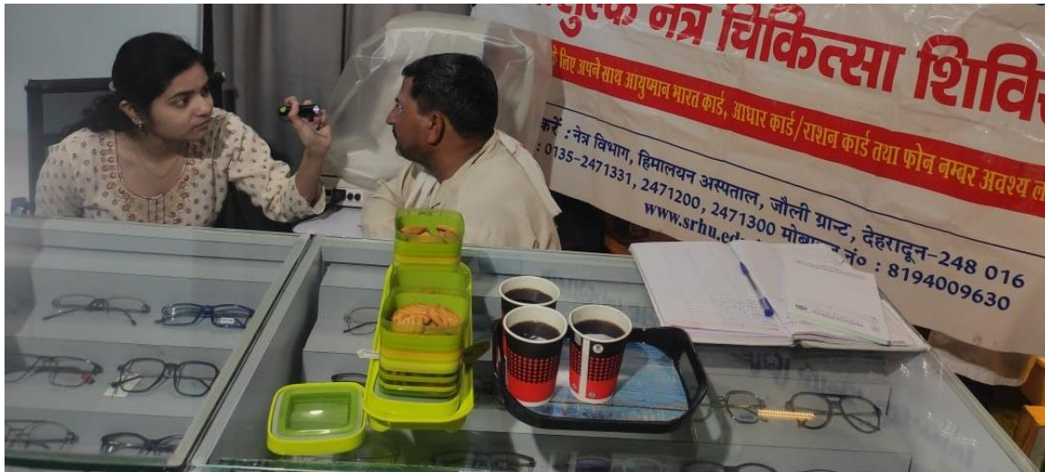
Active student involvement in community-based eye screenings.