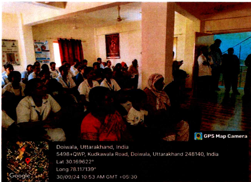
2. Patients and relatives watching the program prepared by students in Urban Health Centre ,Kudkawala, Doiwala