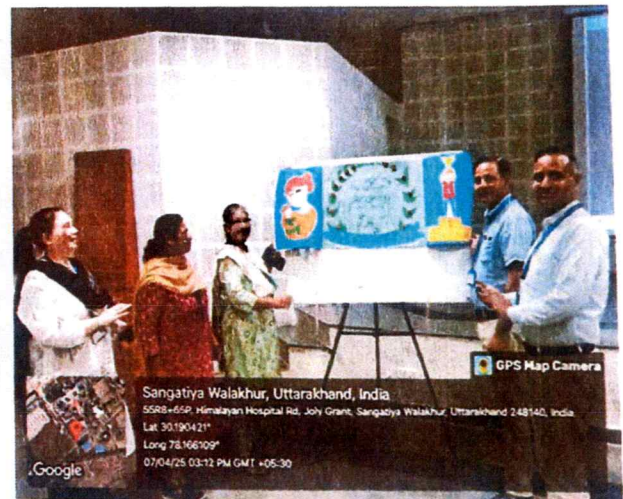
Picture -2 Poster Exhibition on Theme of WHO Day – 2025 "Healthy Beginnings, Hopeful Futures" Inaugurated by Vice-Principal