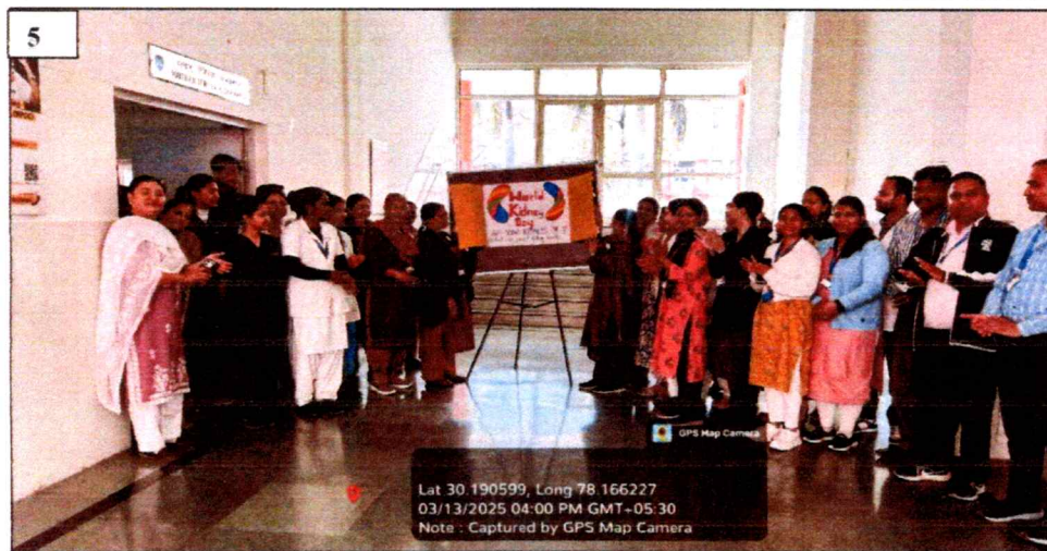
Picture 5: Organizing Team with Principal, Faculty Members and Students, HCN, SRHU