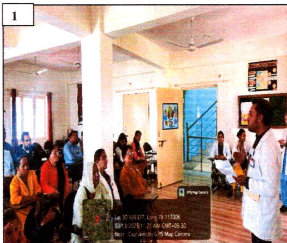
Picture No.1: Welcome Speech given by M.Sc. Nursing Student in Health Centre at Kurka Wala