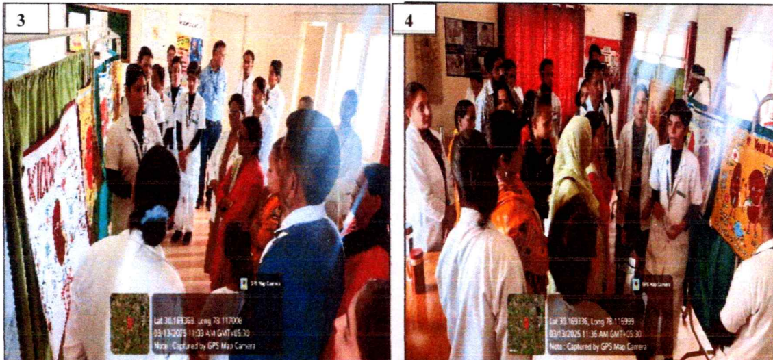
Picture No.3 & 4: Students are giving awareness by poster explanation to Community People at Health Centre, Kurka Wala, Doiwala