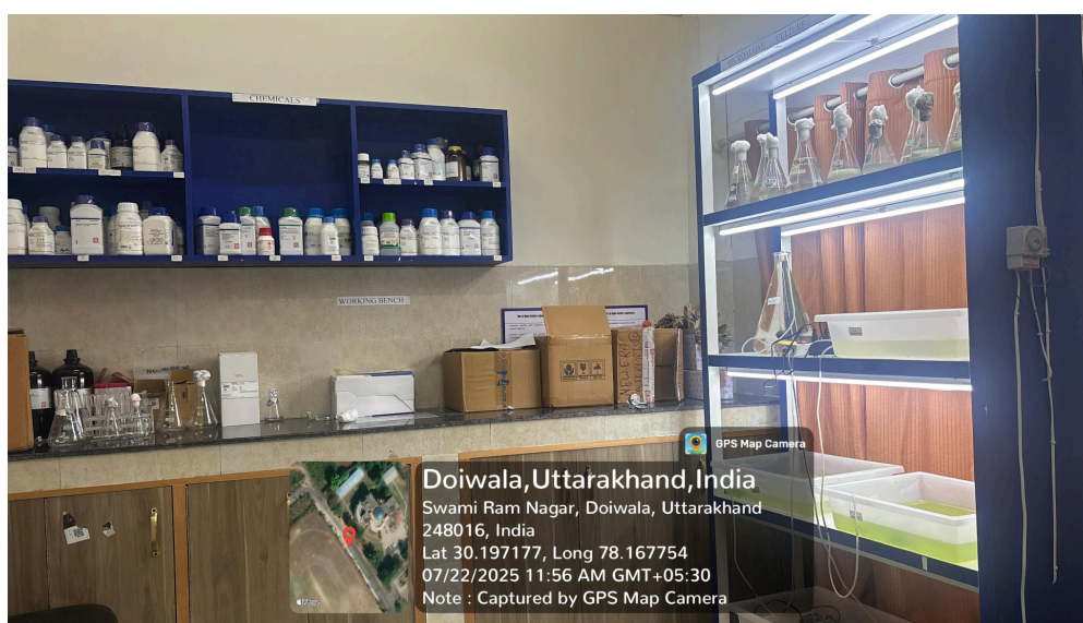
Algal Cultivation Laboratory at School of Biosciences, SRHU

Facilitates the isolation, cultivation, and study of microalgae with potential applications in wastewater treatment, bioenergy, and environmental monitoring. Supports academic training and interdisciplinary research in algal biotechnology and aquatic health.